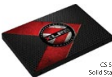
CS Series Solid State Drives