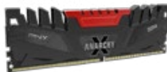
Anarchy PC Memory