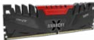
Anarchy PC Memory