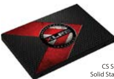
CS Series Solid State Drives